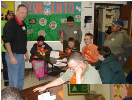
Wood working continues to be one of our most popular hobby activities!

We were able to have the entire event in the classrooms and "mansion" of Oconomowoc Developmental Training Center. We had a total of nine hobby/activities: Woodworking, Eggstra Special Box, Fun with Foam, Tie-a Blanket, Painted Sun Catchers, Scented Soaps, Floral Arrangements, Beaded Necklaces and the activity group for ages 8 and under.