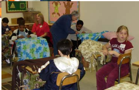
Working on the Tie-A-Blanket was easier than I thought!

We had a quiet area for people who were feeling tired or overwhelmed by all the activity going on. The dance continues to be a success as we were able to chat with friends, catch up with folks we hadn't seen in a while and dance our hearts out!! As you